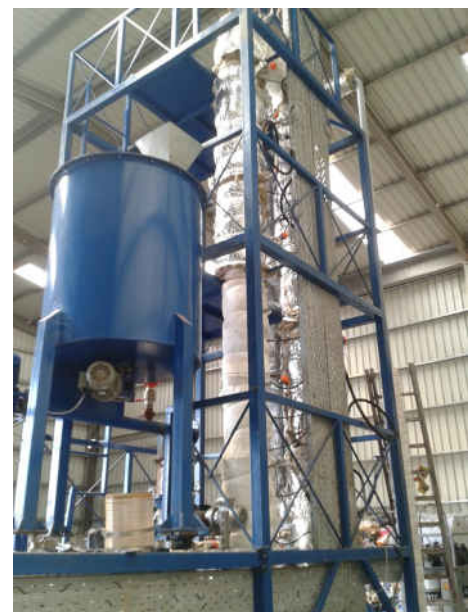
Image 1. Circulating fluidized bed gasifier.