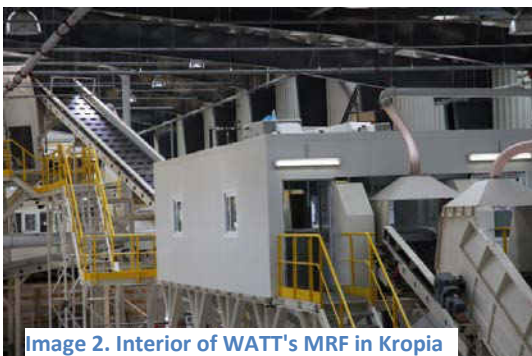
Image 2. Interior of WATT's MRF in Kropia

The website is the main dissemination tool providing available valuable and updated information and instructions. In the framework of the on-line project dissemination for facilitating the wider dissemination of the project results, the project website is included as a link in similar websites from other EU-funded projects: the EU-funded project "BIOFUELS-2G", http://www.biofuels2g.gr/ and the European commission webpage http://ec.europa.eu/ . In addition, a link to the project's website is provided through the project members' own websites: www.watt.com.gr , www.lignite.gr , www.pkm.gov.gr , www.eref-europe.org , www.certh.gr , http://iswm-tinos.uest.gr . It is highlighted that in order to facilitate the transferability of the results, the website will be operational for at least five (5) years after the project termination according to the Approved Application Form. Finally, for the wider promotion of project's work via the internet, research was conducted in order to examine the provided results related to the project in several search engines: Google, Bing, Yahoo, Ask, Wow, WebCrawler, MyWebSearch, Infospace, Info, DuckDuckGo, Blekko, Contenko, Dogpile, Alhea, and with specific keywords: the acronym of the project, words "waste management", "RDF / SRF classification", "RDF gasification of waste", "energy use non-recyclable materials",